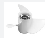
6. Aluminium propeller