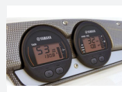
3. LAN meters -RPM -trim -warnings -speed -fuel level -fuel economy