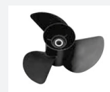
7. Steel propeller, black