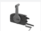
1. Remote control unit 703