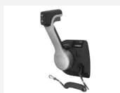
4. Electronic remote control unit