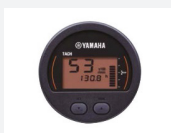
2. LAN meter -RPM -trim -warnings