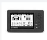
5. 4" color screen -RPM -trim -warnings -speed -fuel level -fuel economy